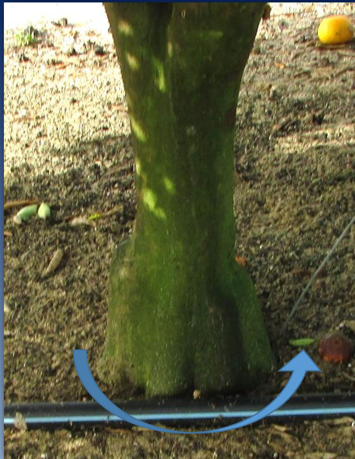
Circumference Measured in cm

2 lbs. per acre – 4 Week Interval - 15 Trts